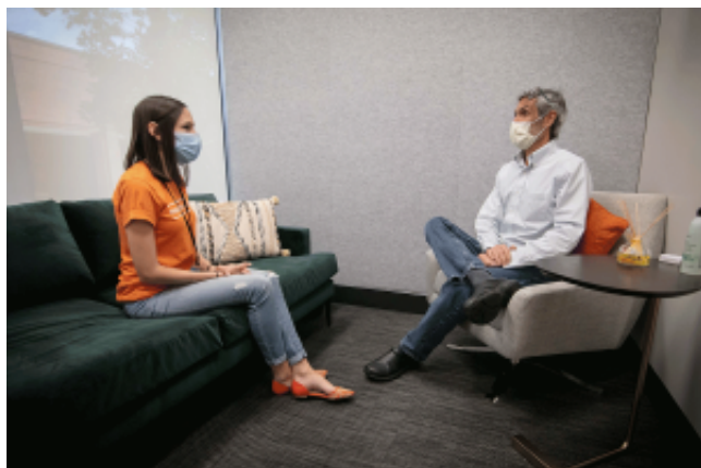
Amazon health center

Google is turning smartphones into sophisticated health measurement tools. As of February, the Google Pixel phone doubles as a health tool, thanks to new technology that can detect and measure heart and breath rate through the phone’s camera. Google is also taking a second stab at personal health records. In April, Stat News reported that the Big Tech company is exploring a personal health record tool for patients—almost ten years after its initial attempt, Google Health, was shut down.